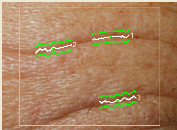
Photo Width: 488 Height: 368 Tracking Complete. Track Length: 101 Date: 26-Aug-2009 19:00:56